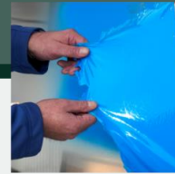
Forms a very flexible and tough film