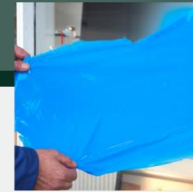
Easy to peel off